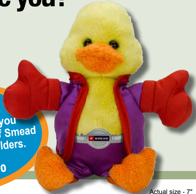
Actual size - 7"

FREE Tuff Duck when you purchase 2 boxes of Smead TUFF® Hanging Folders. January 1 - June 30, 2010